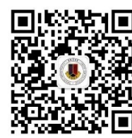
WeChat Public Account